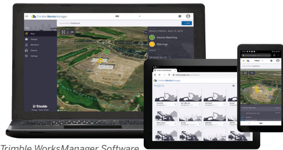
Trimble WorksManager Software

With the Trimble SNM941 Connected Site Gateway, transfer 3D designs from the office to the machine wirelessly and automatically so that the operator is always using the latest design. Productivity data collected from the machine can automatically sync back to the office.